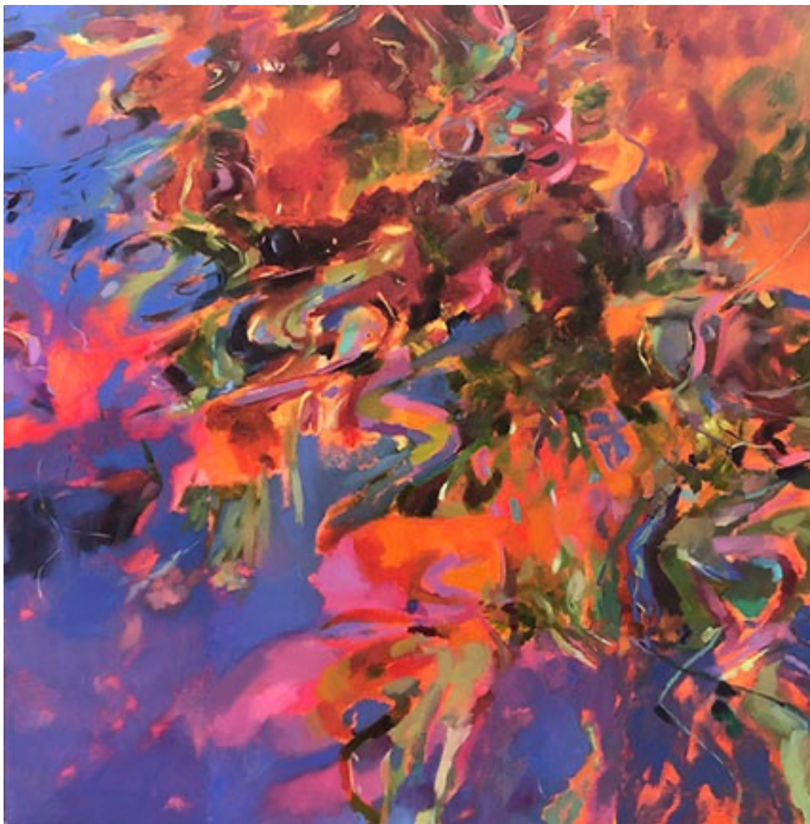
Valley of the Red God 1V Oil on canvas 180 xx 180 cm Price: R98,000