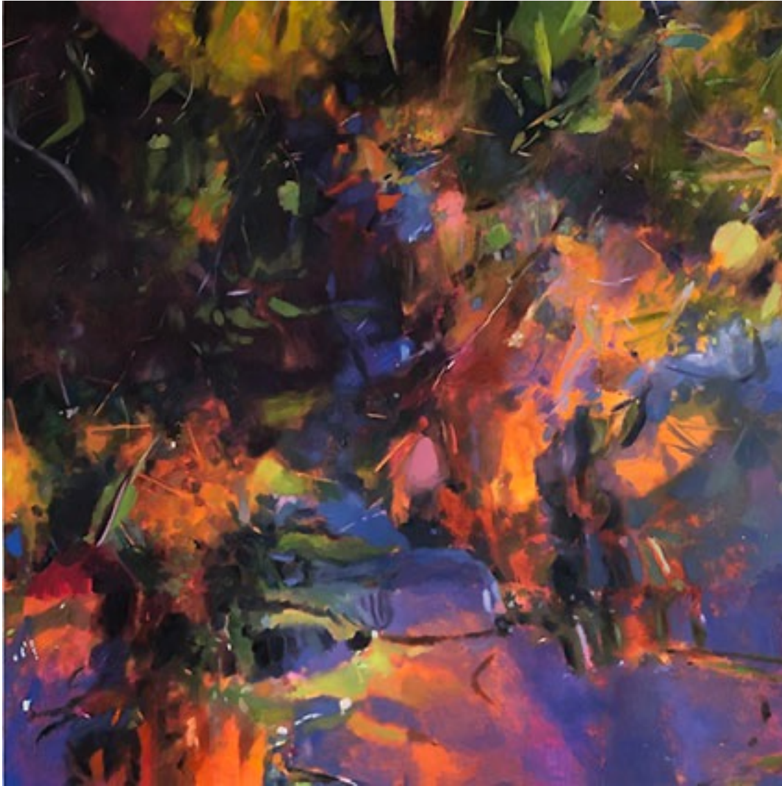
Valley of the Red God 1 Oil on canvas 180 x 180 cm Price: R98,000