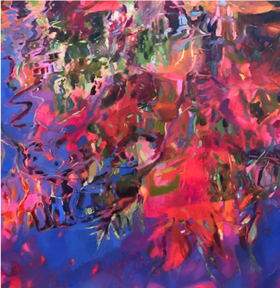
Valley of the Red God 111 Oil on canvas 180 xx 180 cm Price: R98,000