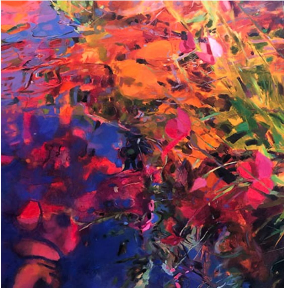
Valley of the Red God 11